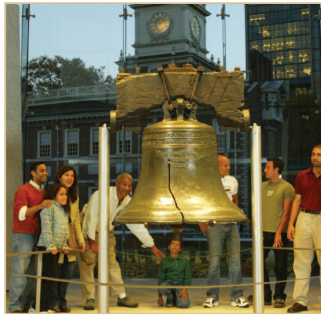
Liberty Bell, Philadelphia

After breakfast, we head home with fabulous memories of our Atlantic City adventure. Breakfast