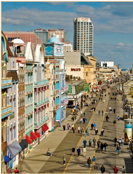
Atlantic City's boardwalk