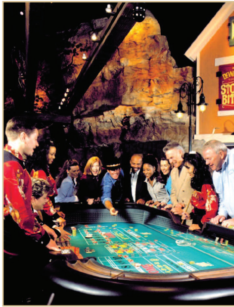
Gaming at Bally's