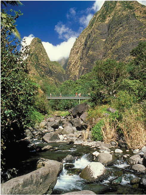
Maui's Iao Valley

Hawaiian Islands. Enjoy a relaxing scenic cruise on the Wailua River to visit the Fern Grotto, before continuing to our hotel. Dinner